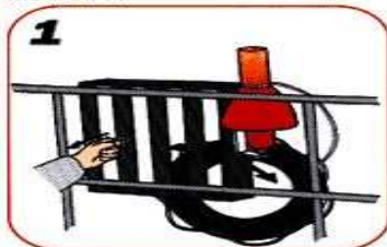
Pull out lock pin.