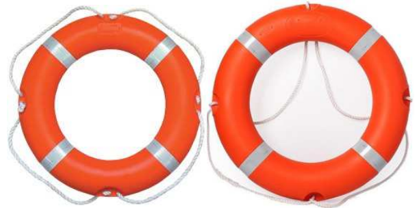
UltraSafe B1 (Weight Not less than 2.5 Kg )

Dedicated to Merchant Shipping | Defence Marine Operations Coastal & Inland Waterways | Disaster Management Fishing | Sport | Tourism & Recreational