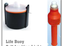
Life Buoy Self Igniting Light