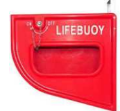
Quick Release Case